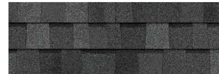
Estate Gray †