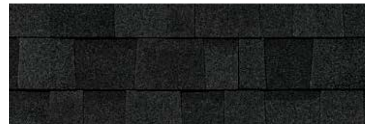
Onyx Black †