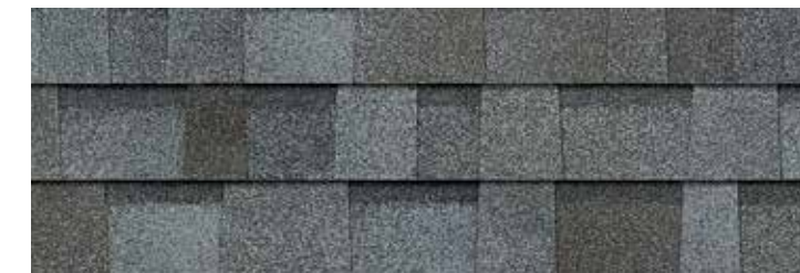
Quarry Gray †