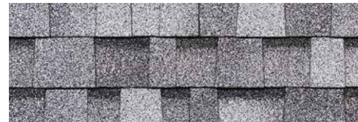
Sierra Gray †