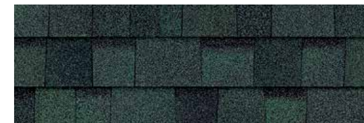
Chateau Green †