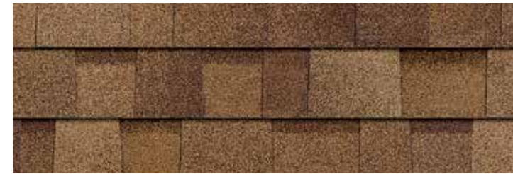
Desert Tan †

COLOURS AVAILABLE IN ALL SERVICE AREAS—see map below