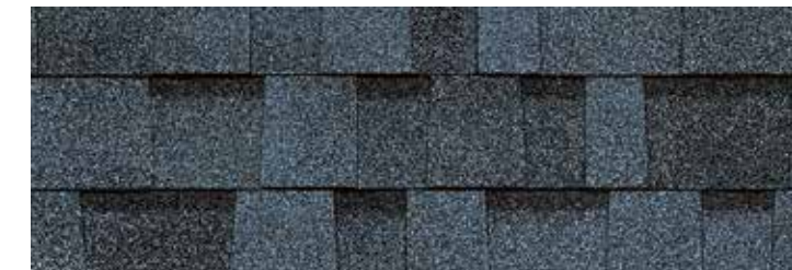
Harbor Blue †