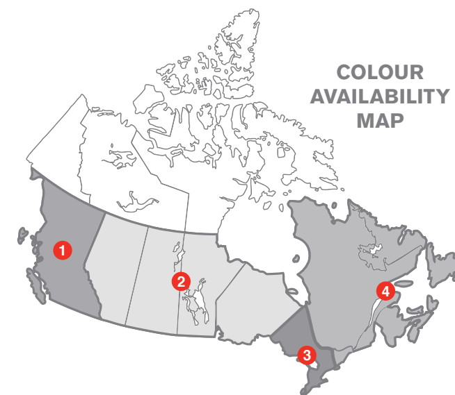
COLOUR AVAILABILITY MAP